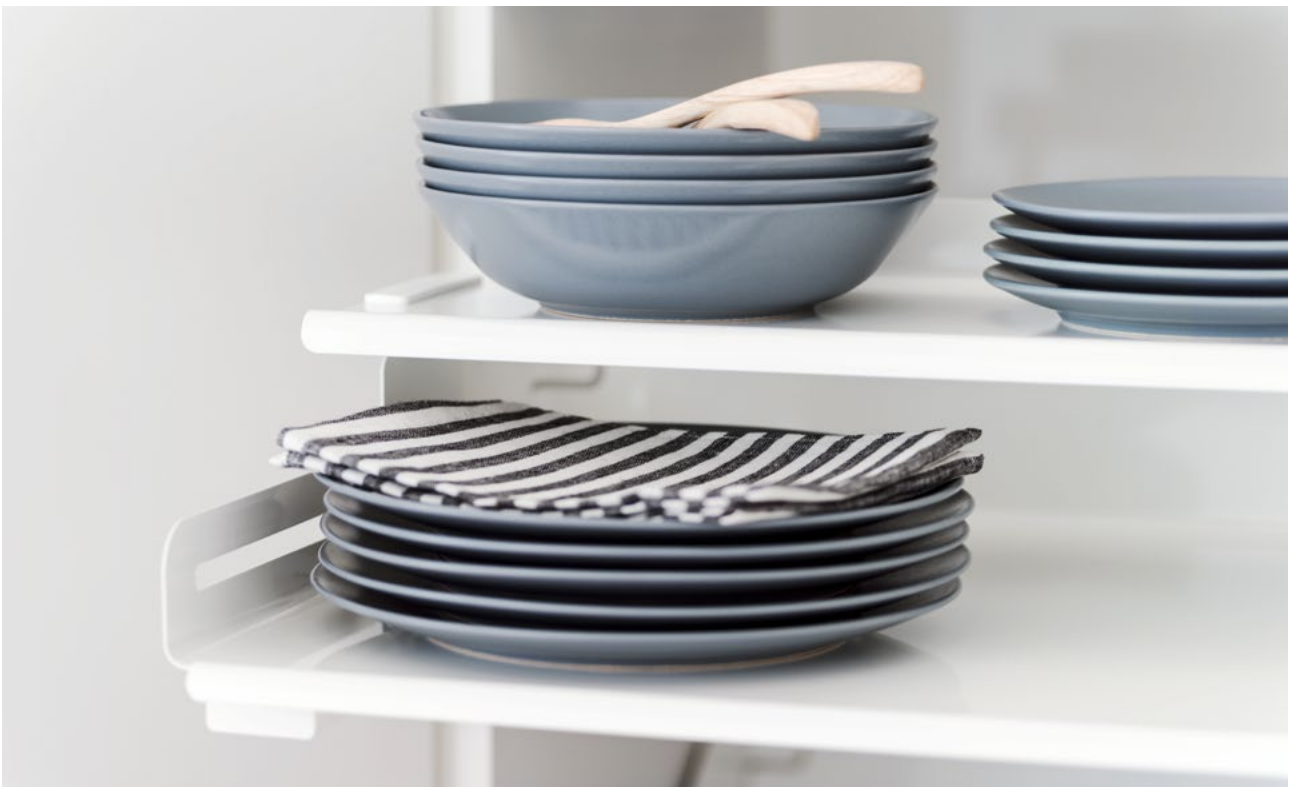
Extra shelves for Extendo: Creates an additional shelf level