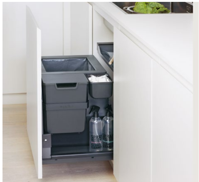
Oeko Complet waste system: The hard-wearing complete system for household waste sorting