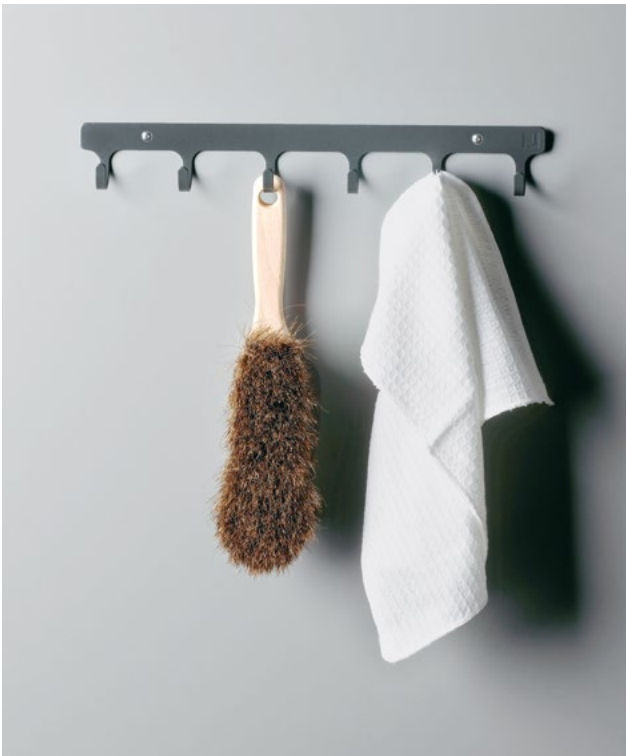
Libell hook rail: This classic rail with six hooks has a wide range of uses throughout the home