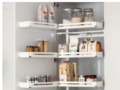
Store your groceries in one central unit, not in different cupboards. → Pleno Plus larder pull-out