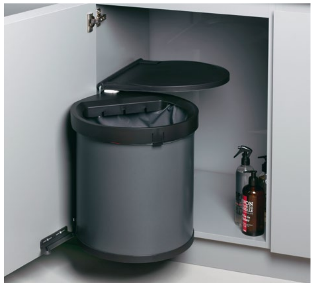
Müllboy Big waste system: The super-sized round bin for practical kitchens