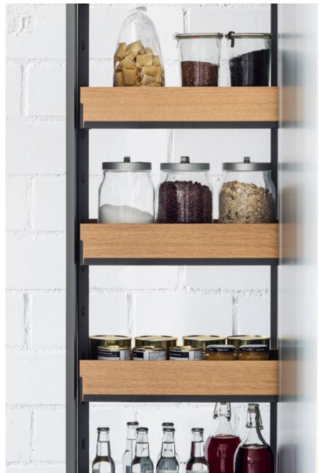
Hochschrank Standard larder pull-out: The handy front pull-out for practical kitchens