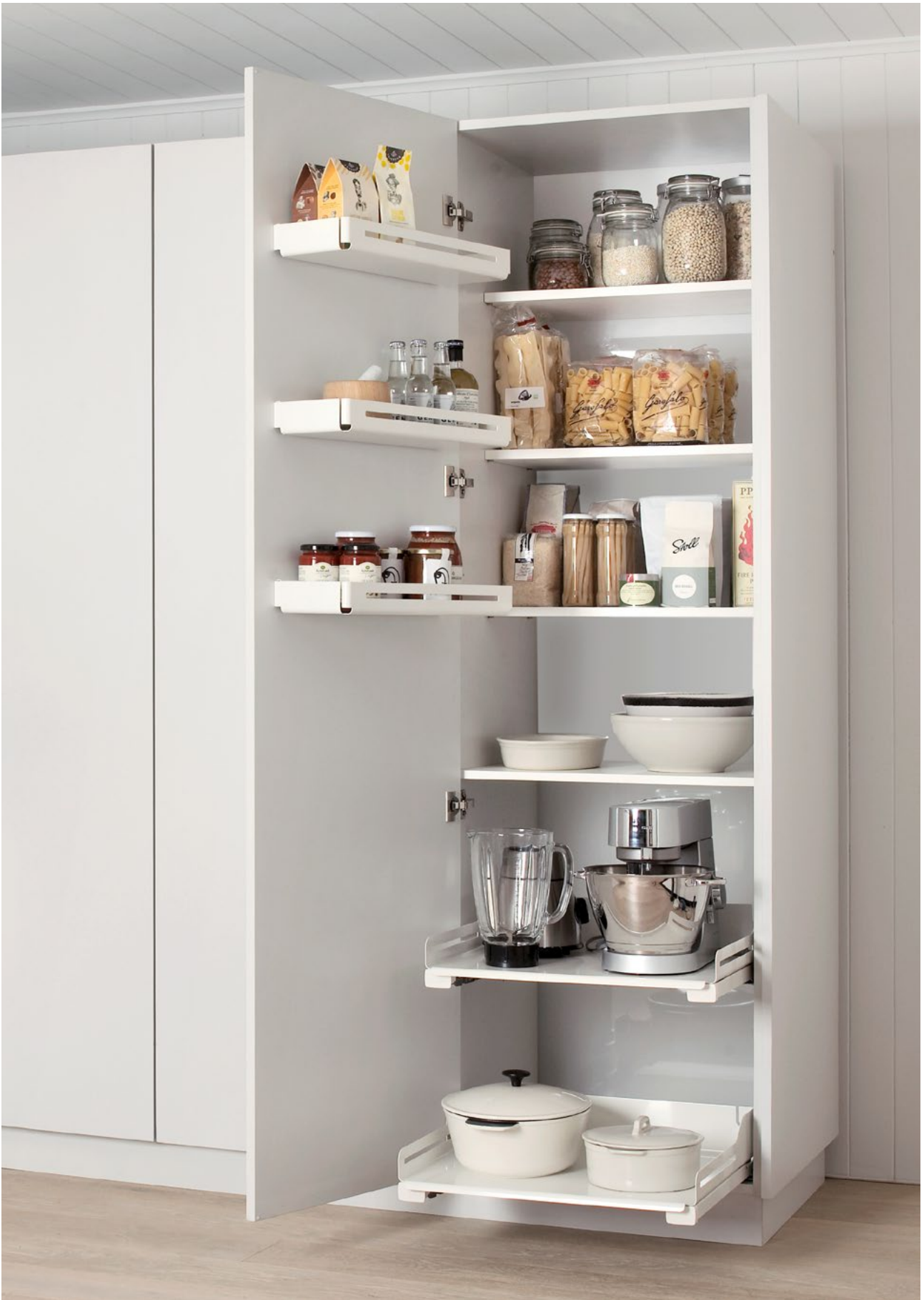
Trio larder unit system: Shallow fixed shelves coupled with three door shelves: just open the unit door to reveal Trio's unique, user-friendly layout. The two Extendo shelves at the bottom are extendable.