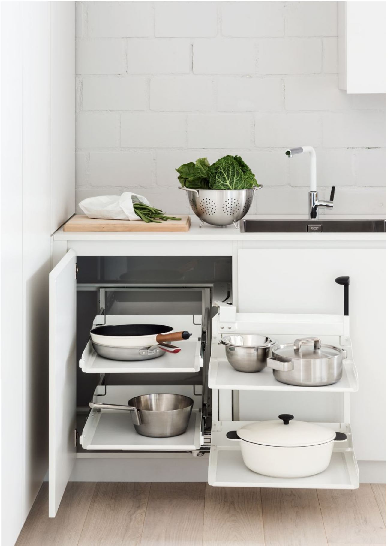
Magic Corner Comfort corner pull-out: Optimal use of space in corner units