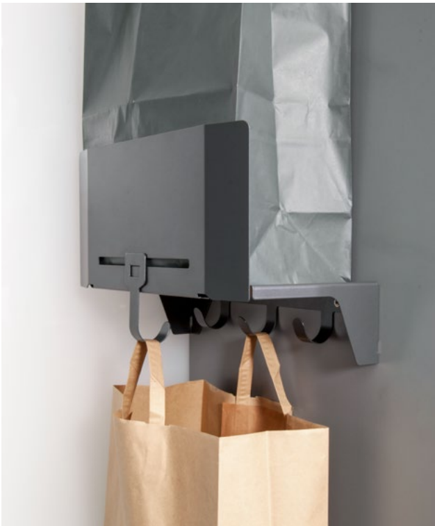
Sesam Bag: Compact recycling station. Room for up to three bags.