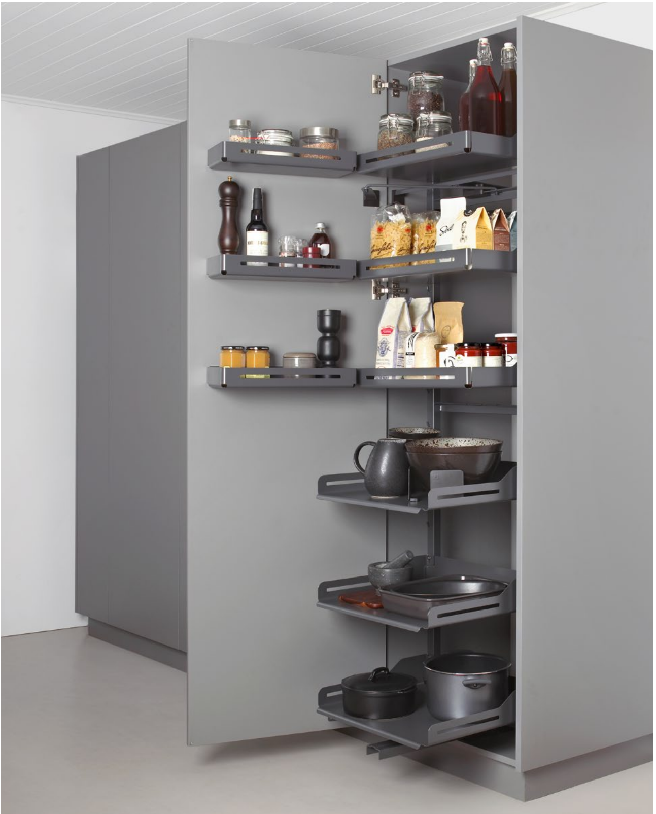
Pleno Plus larder pull-out: Laid out just like a refrigerator: The small shelves built into the doors offer easy access and the larger shelves slide out of the unit automatically when the doors are opened

Excellent organisation and a clear overview of all your supplies.