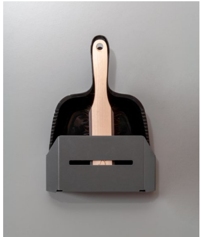
Dustpan and brush holder: Can be installed alone or as a handy addition to a cleaning cupboard or waste system