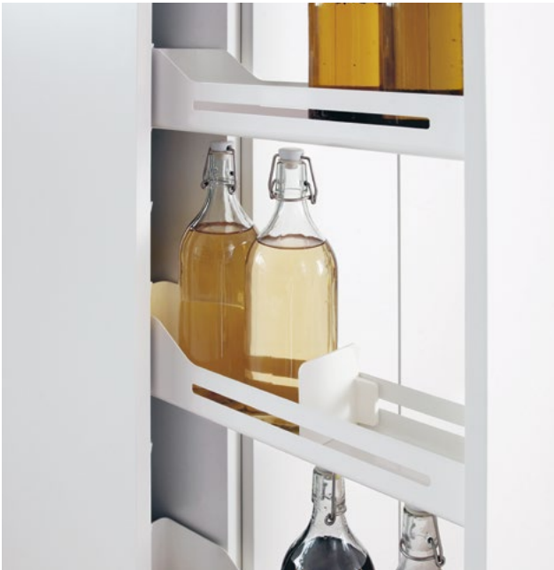
Hochschrank Standard larder pull-out: The handy front pull-out for practical kitchens – for widths from 150 mm