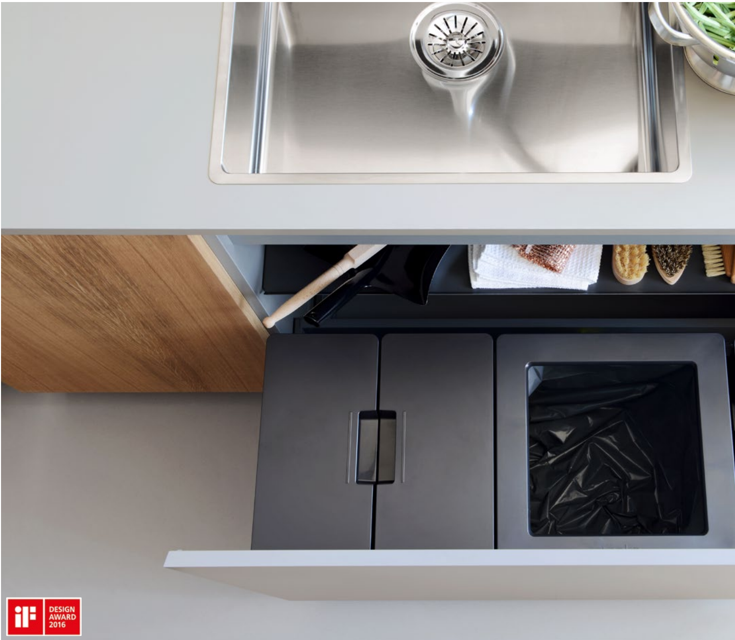
Oeko Universal waste system: The flexible waste system for any drawer pull-out