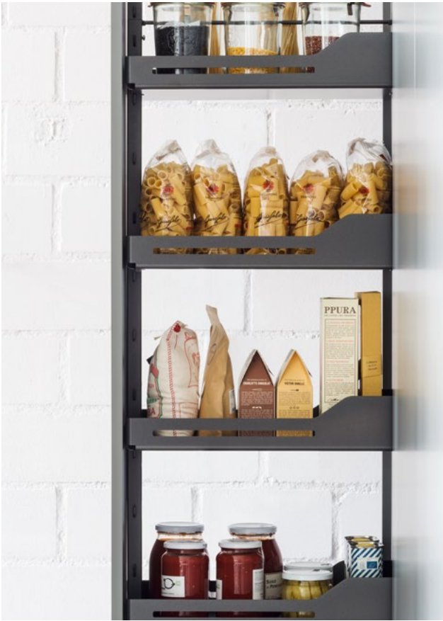
Hochschrank Standard larder pull-out: The handy front pull-out for practical kitchens