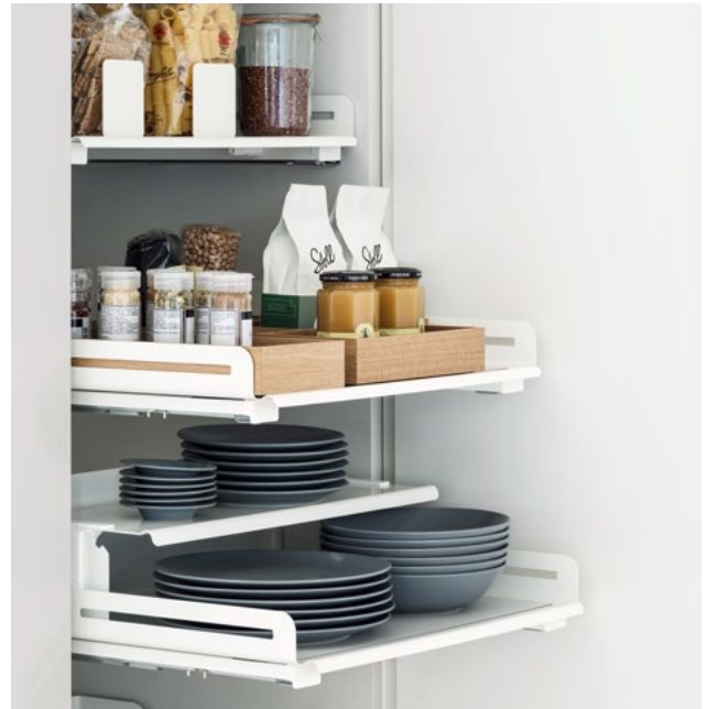
Extendo Libell larder unit system: The flexible pull-out shelf that is right at home anywhere