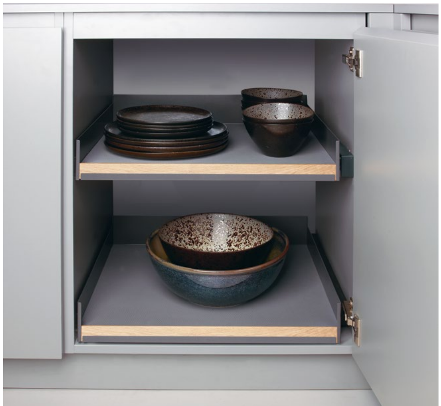
Extendo Fiore pull-out shelf: Including spacer for standard hinged doors