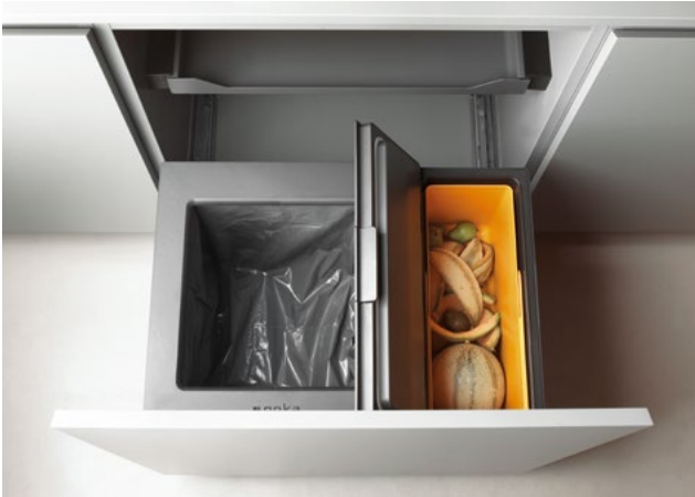
Oeko FreezyBoy Universal waste system: FreezyBoy chills organic waste to -5°C