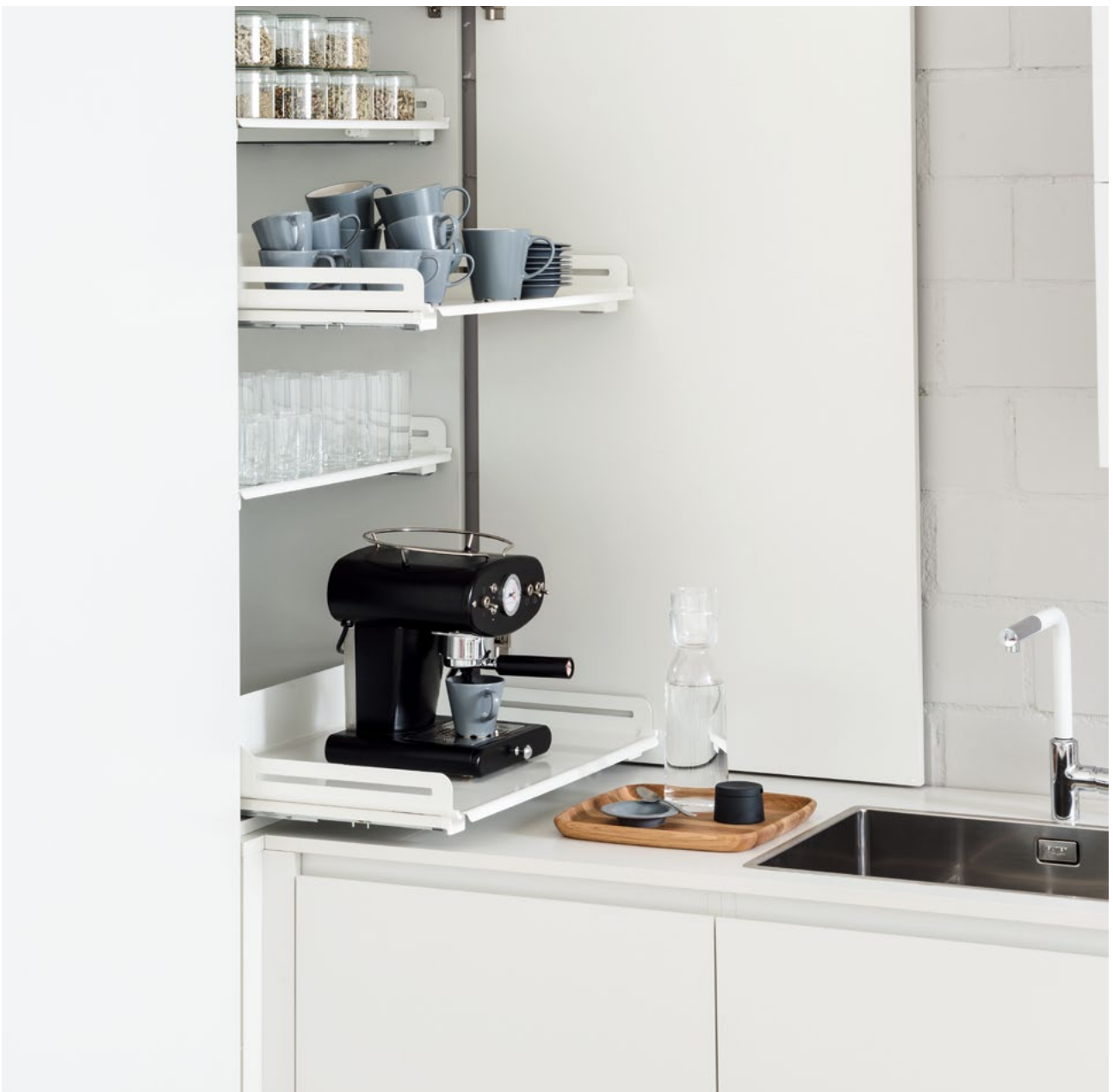
Locking mechanism Click Stop for Extendo: temporarily transforms a movable pull-out shelf into a fixed work surface