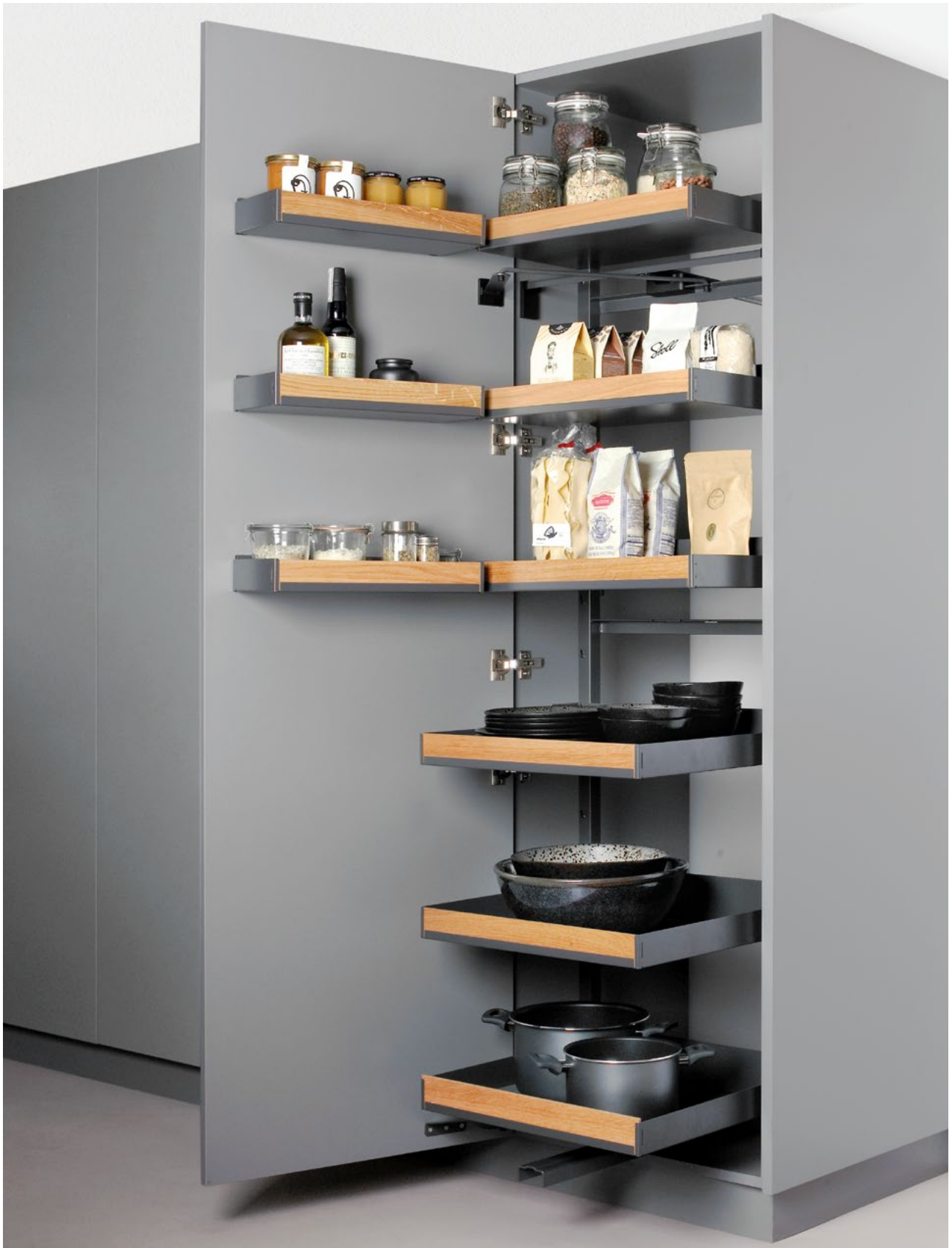
Pleno Plus larder pull-out: Laid out just like a refrigerator: The small shelves built into the doors offer easy access and the larger shelves slide out of the unit automatically when the doors are opened