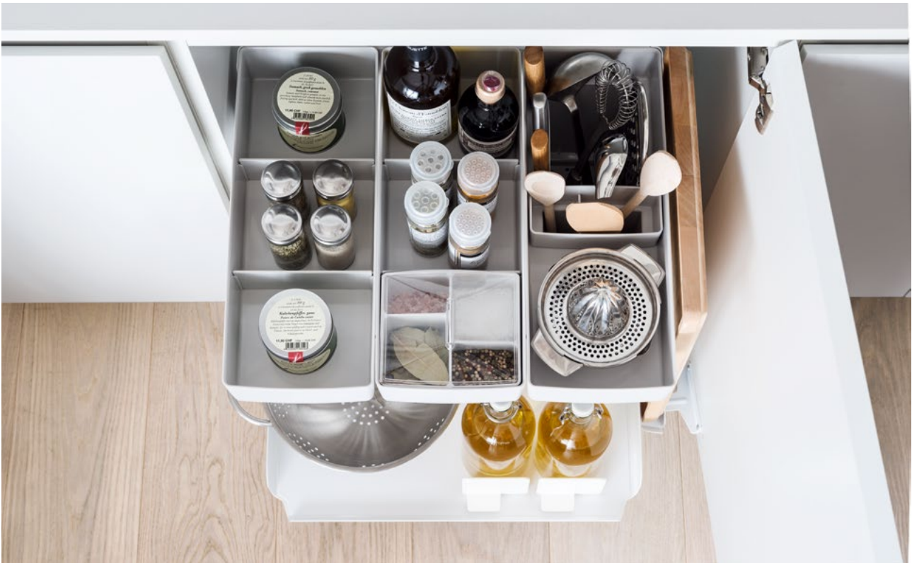
Kitchen Tower base unit pull-out: Compact design for efficiently storing your most-used kitchen utensils in one place