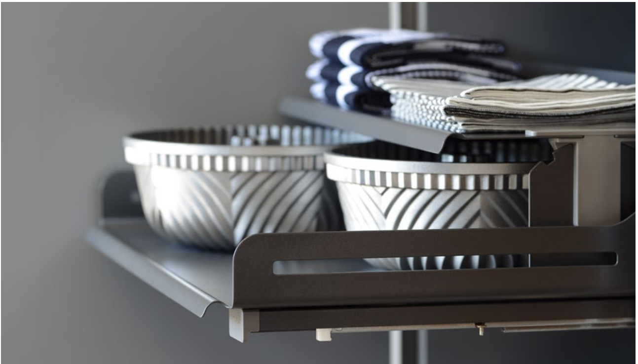
Extra shelves for Extendo: Creates an additional shelf level