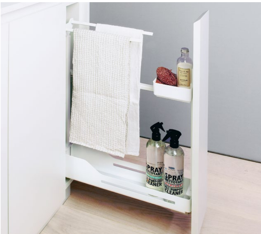
Snello towel rail extension: Discreet storage solutions for hand towels or cloths