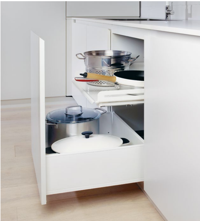
Extendo Libell pull-out shelf: The ideal internal pull-out