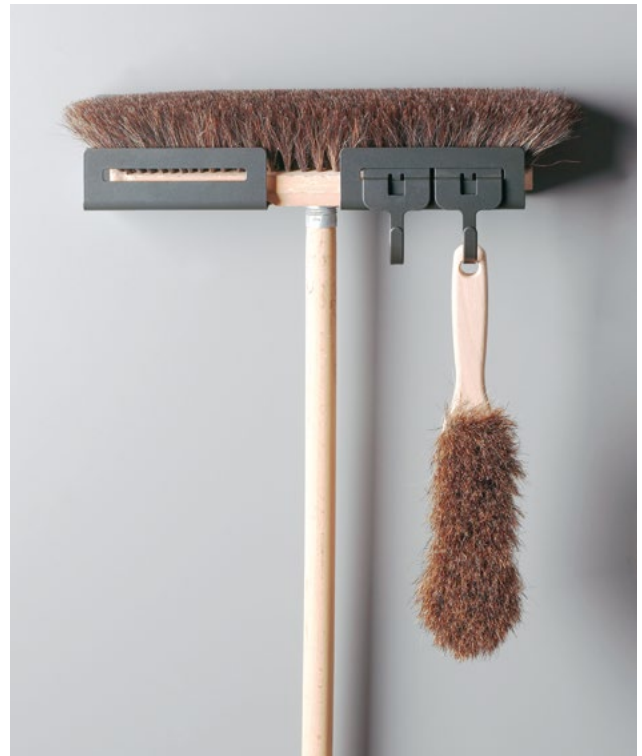
Libell broom holder: Great for storing any kind of broom or brush