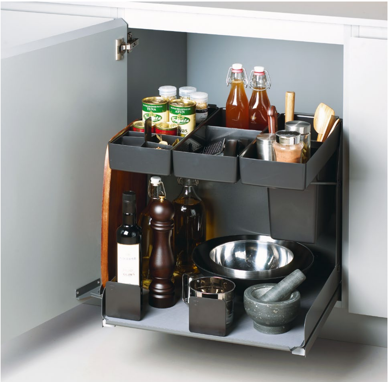
Kitchen Tower base unit pull-out: Compact design for efficiently storing your most-used kitchen utensils in one place

Items that belong together should be stored together – in a single unit.