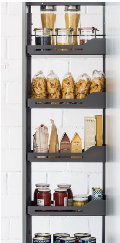
A clear view from the side. → Standard larder pull-out

The major advantage of centralised food storage: you know exactly where to find what you want and you do not need to waste time searching for it. An organised food storage system saves you both time and money: it eliminates the need for walking around and, more importantly, cuts out unnecessary duplicate purchases. peka's contemporary kitchen larder organisers are highly versatile and can easily be adapted to suit whatever you want to store.