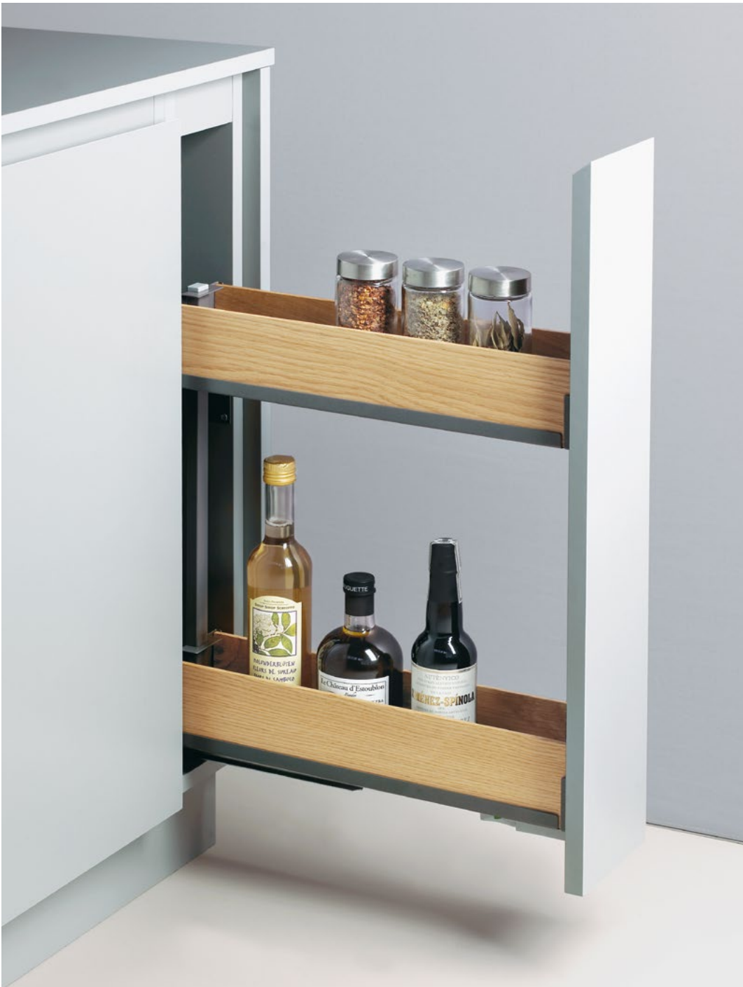
Snello base unit pull-out: The space-saving pull-out system for compact kitchens