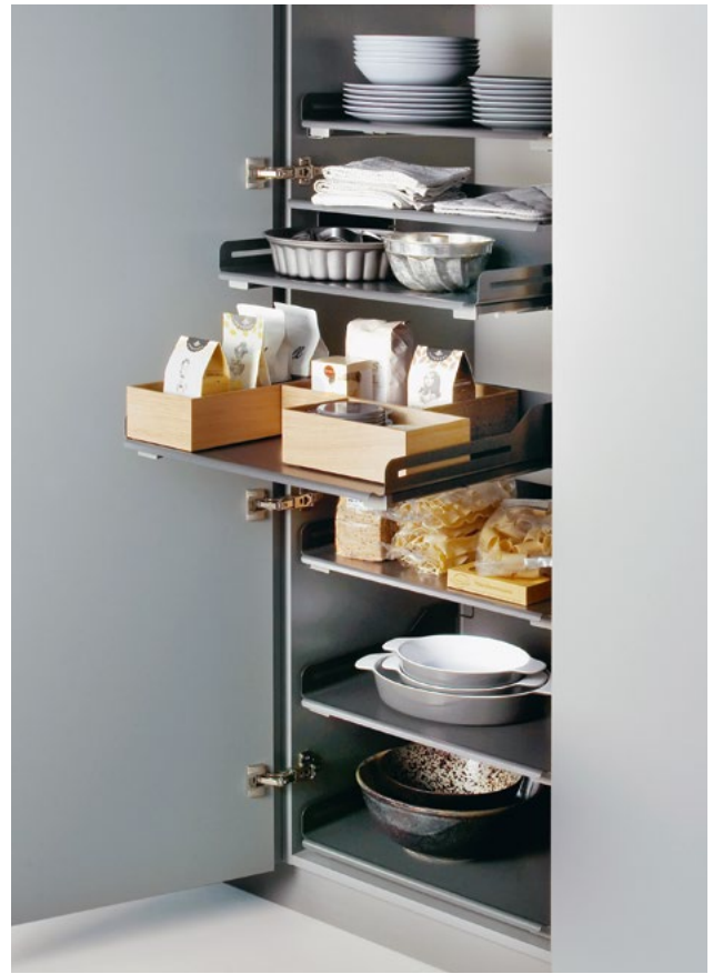
Extendo Libell larder unit system: The flexible pull-out shelf that is right at home anywhere