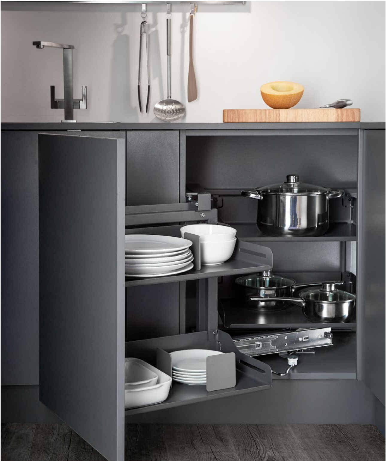
Magic Corner Standard corner pull-out: Just swing the front panel and the front shelves to one side and the back shelves automatically slide forwards