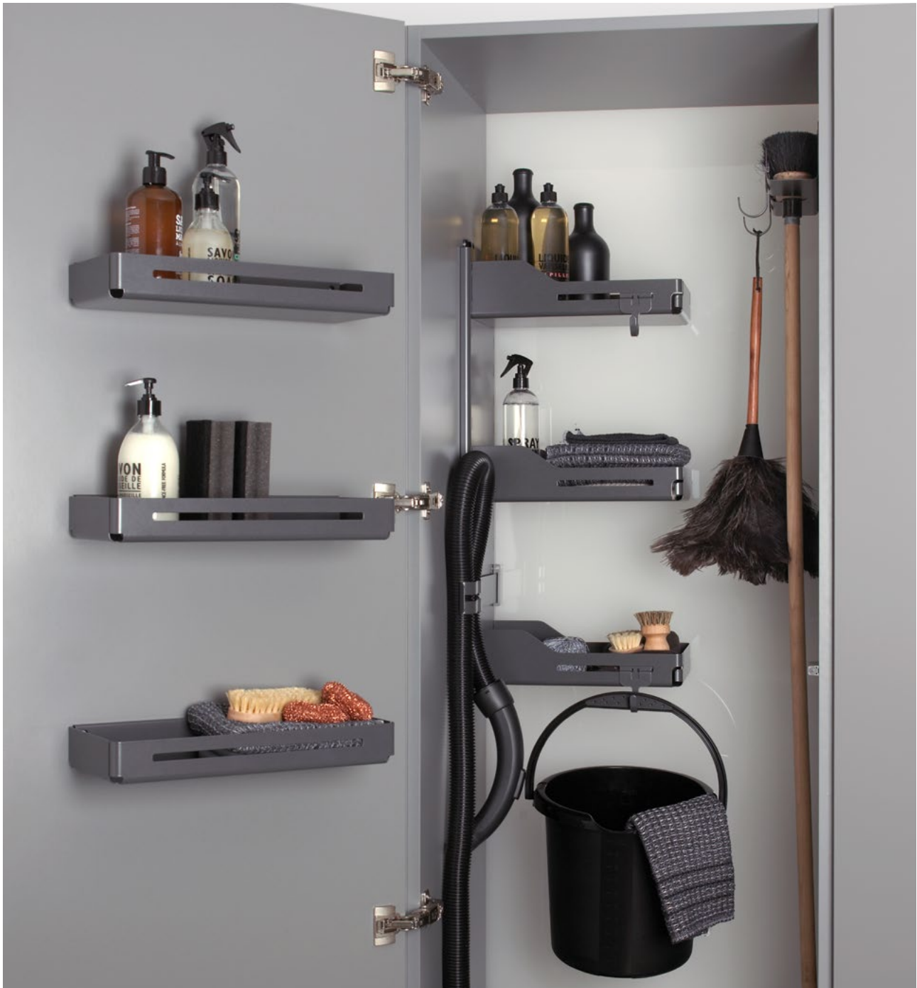
Sesam Standard and Tablo (left) for cleaning cupboards: For organised storage of cleaning and housekeeping items

Even a cleaning cupboard can be neat and attractive!