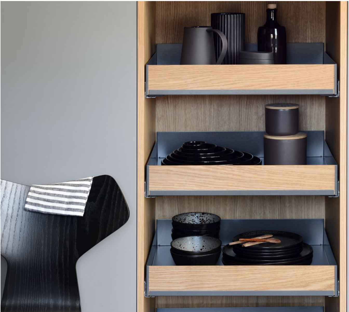
Extendo Fiore pull-out shelf: The flexible pull-out shelf that is right at home anywhere

Understated elegance from the kitchen to the living room