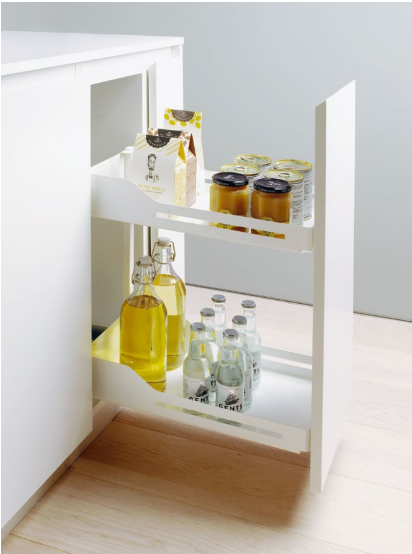
Snello base unit pull-out: The space-saving pull-out system for compact kitchens