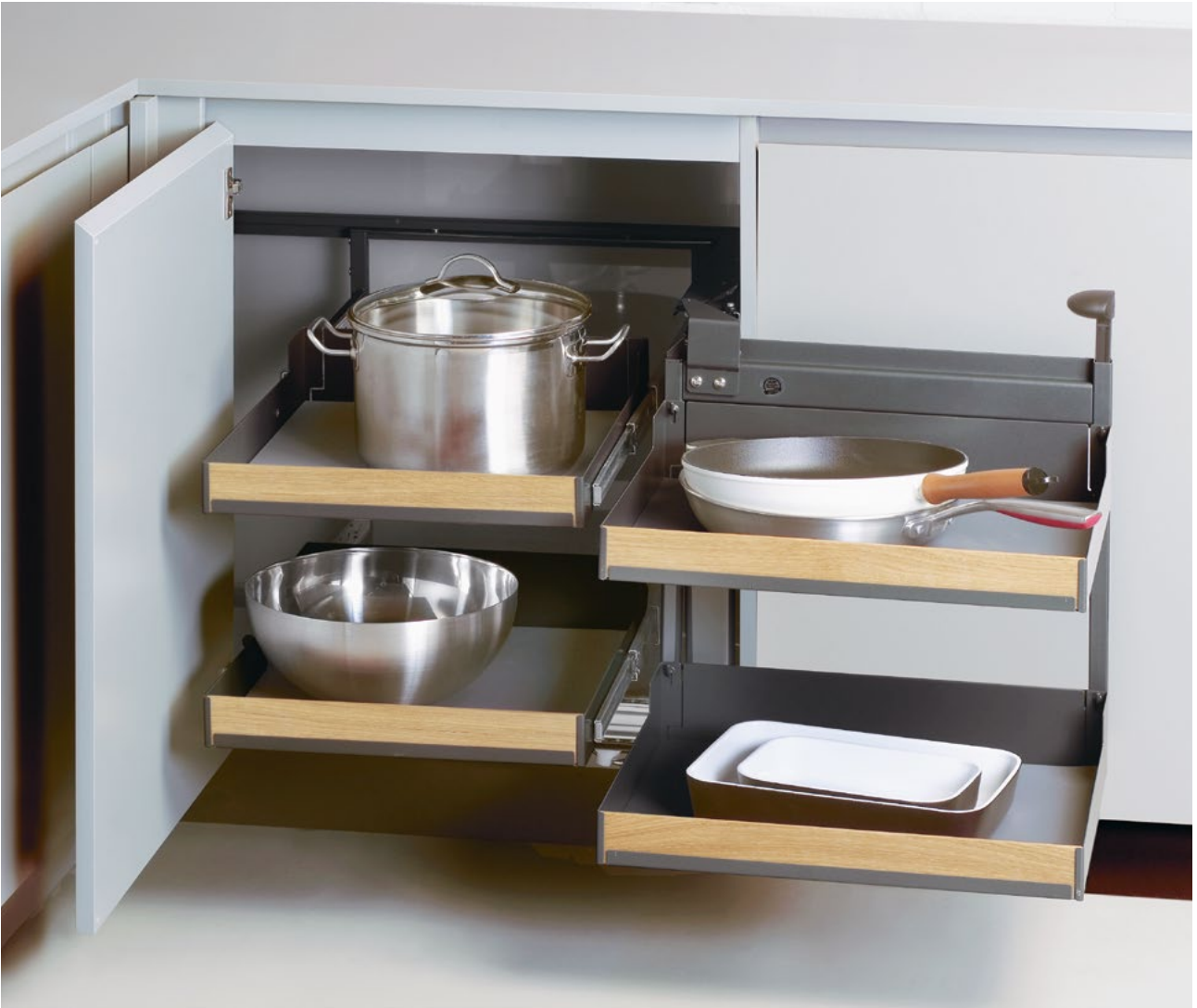
Magic Corner Comfort corner pull-out: Optimal use of space in corner units

Cooking is so much easier when everything is organised!