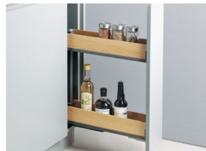
Store bottles and condiments together in a smart base unit pull-out. → Snello base unit pull-out