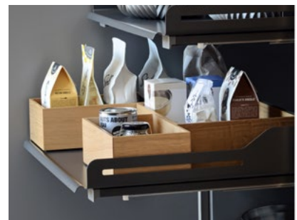
Flexible systems for dividing up your storage space. → Wooden boxes