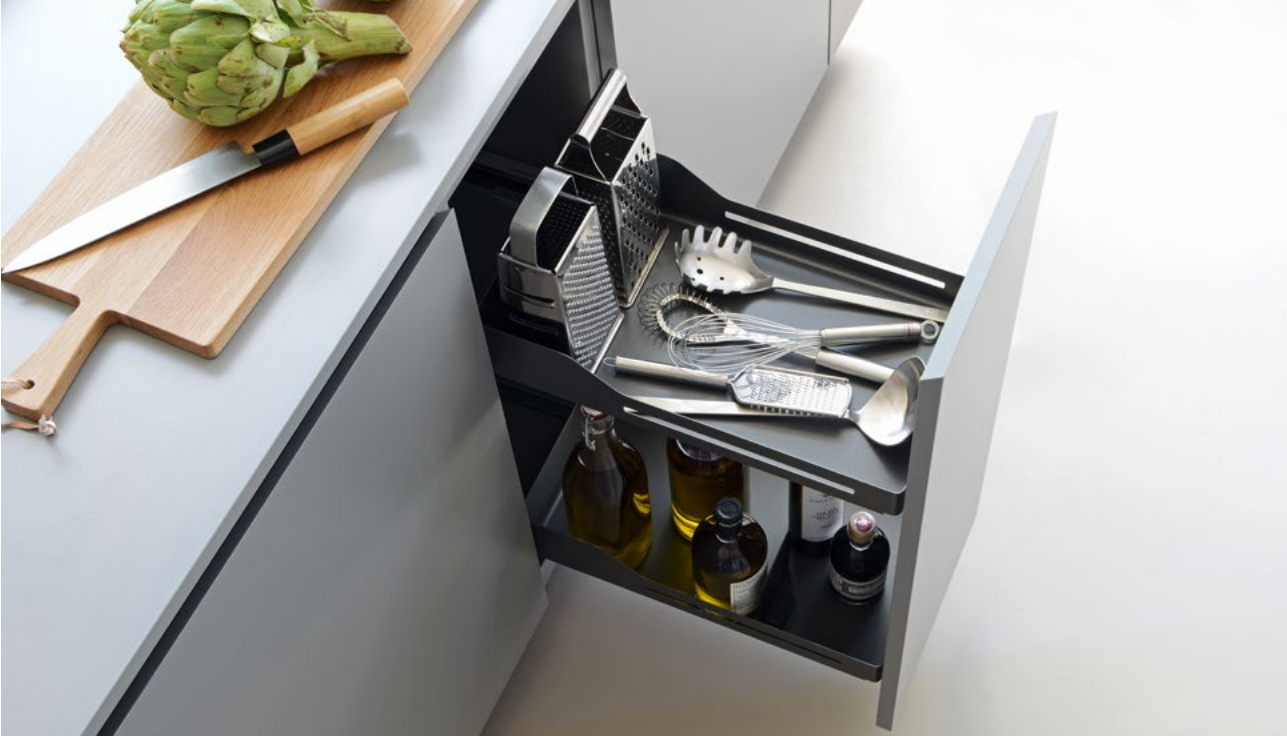
Snello base unit pull-out: The space-saving pull-out system for compact kitchens

Day-to-day use soon highlights the difference between good design and perfect design.