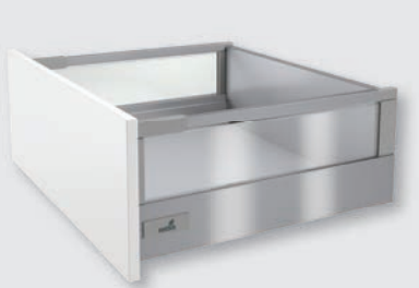
Pot-and-pan drawer with TopSide glass, height 176 mm