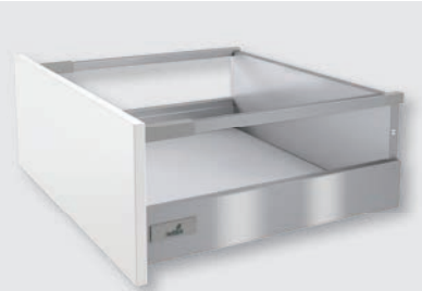
Pot-and-pan drawer with railing, height 176 mm