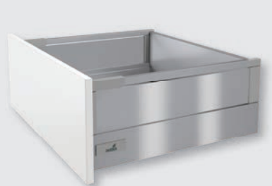
Pot-and-pan drawer with TopSide metal, height 176 mm