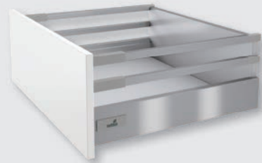
Pot-and-pan drawer with double railing, height 176 mm

Standing apart from the competition while still keeping costs in check? Not a problem. Based on just one drawer side profile, InnoTech Atira gives you a wealth of options for individualised yet easily producible furniture line solutions. A large choice of side elements and rear panel widths, numerous colour options and a variety of runners – there's no limit to your creativity. And upgrading couldn't be easier either. The cost and work involved in production, stockkeeping and logistics are reduced to a minimum.