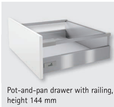
Pot-and-pan drawer with railing, height 144 mm