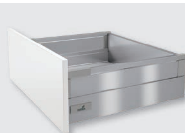
Pot-and-pan drawer with TopSide metal, height 144 mm