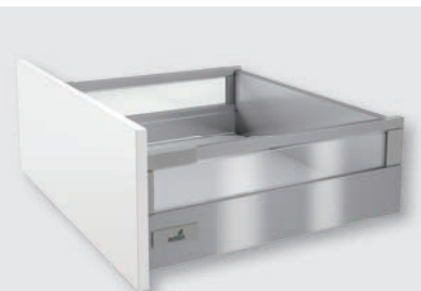
Pot-and-pan drawer with TopSide glass, height 144 mm