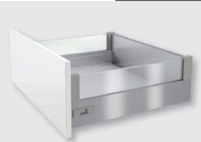
Pot-and-pan drawer with DesignSide, height 144 mm