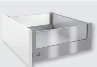
Pot-and-pan drawer with DesignSide, height 176 mm