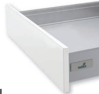
Basis = drawer side profile, height 70 mm